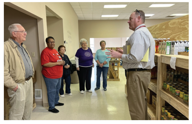
JPMC team members and volunteers gathered at the Mayfield-Graves County Needline and Food Pantry, the first recipient of many to receive funds from Lifepoint Health's $1 million donation to the restoration of Mayfield and Graves County following the December 2021 tornado.